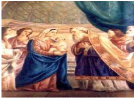
Month of the Holy Name