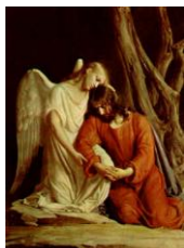
Month of the Passion of Our Lord

===== Celebration – Black History Month Program Sunday, February 24, 2019 following the 11:30 Mass In St. Dominic Parish Hall