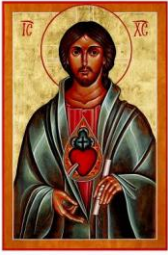
Month of the Most Precious Blood