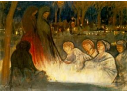
Month of the Holy Souls