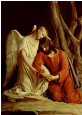
Month of the Passion of Our Lord