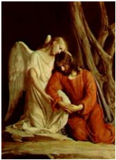
Month of the Passion of Our Lord