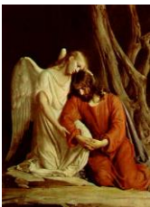
Month of the Passion of Our Lord